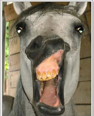
“ One horse's reaction when asked to run another Triple Crown trail... ”

Alternatively referred to as "The Run for the Roses" or "The Most Exciting Two Minutes in Sports," the Kentucky Derby is a 1.25 mile race for three-year-old thoroughbred horses. The Kentucky Derby draws an average of 150,000 visitors each year, including residents, out-of-towners, celebrities, presidents, and even members of the royal families.